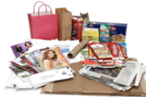
Newspaper, Glossy Inserts & Magazines Mixed Paper (Junk mail, phone books, envelopes) Cardboard (Break down and cut to fit into cart)