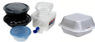
Plastic & Styrofoam Food Containers, Lids & Loose Caps