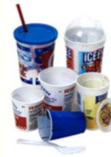
Plastic Cups & Tubs, Lids & Utensils