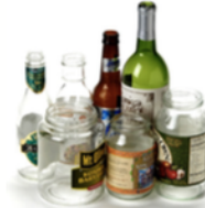
Glass Jars & Bottles (All colors)