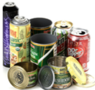
Aluminum, Tin & Empty Aerosol Cans