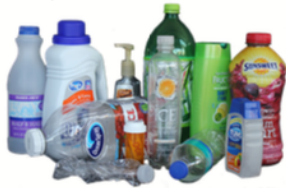
Screw-Top Plastics (with caps) & ONLY Yogurt & Margarine Tubs (no lids)