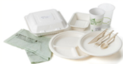
Compostable Cups, Plates, Utensils & Bags