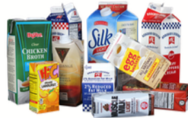
Paper Food Cartons (no caps) (not cylinder shaped)