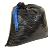
Garbage or Yard Debris